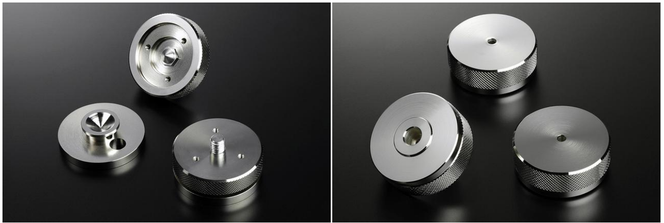
In order to thoroughly countermeasure vibration of the heavyweight body, F-03A adopts pinpoint foot (left), F-05 adopts steel insulator (right), and it supports at four points

Machida : Also, the control system is inside the front panel, the main body of the preamplifier is in the vicinity of the back panel itself, but since it is connected via all what is called isolator, the configuration that does not propagate microcomputer noise etc. at all is.