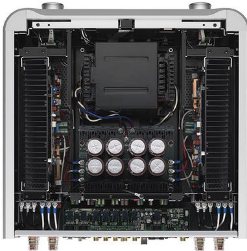
Internal structure of F - 03A. The pre-section and the power amplifier input stage are splendidly arranged symmetrically, and you can see that the parts etc. are tightly packed. He said that there was considerable difficulty in putting the idea of separate into an integrated type

Mr. Kato : It is easy to understand that audio signals are connected at the shortest in terms of sound quality, but in the case of amplifiers, how to prevent loss by supply of power to drive amplifier circuits is considered an important factor.